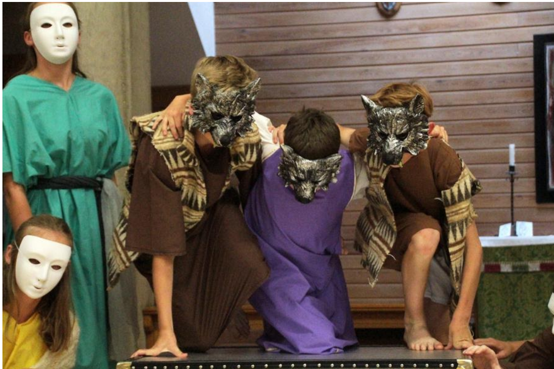
Students participating in a previous year of the Bristol Festival of Latin Drama